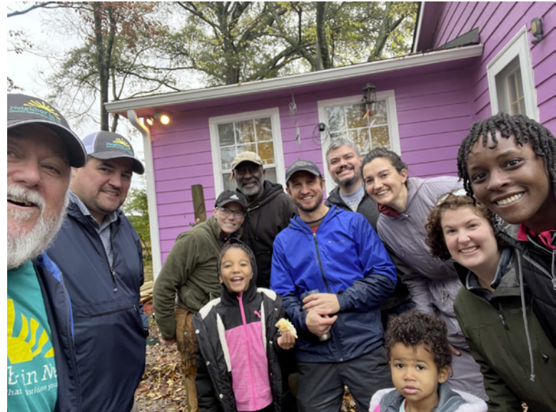
NEIGHBOR IN NEED WESTVIEW

There are many communities in need.. If you know a leader in a community that wants to start their own program, please refer them to neighborinneed.org and have them fill out the " Contact Us " form. We can help them establish their own chapter and start making an impact in their community!