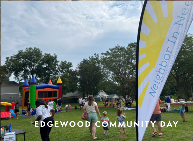
EDGEWOOD COMMUNITY DAY