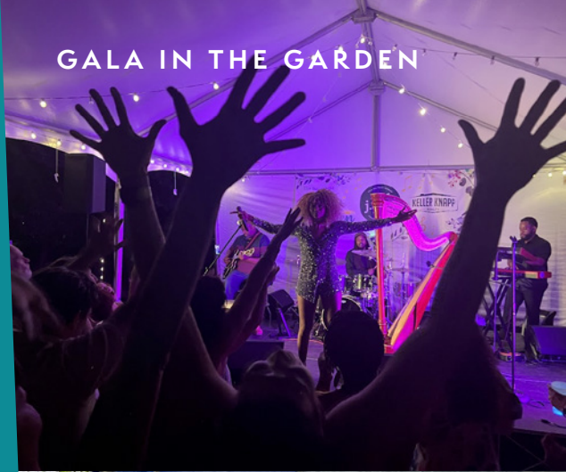
GALA IN THE GARDEN