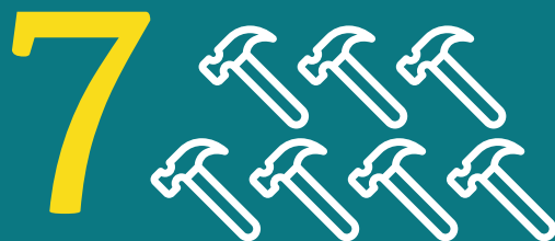
EXTERIOR CARPENTRY & REPAIRS