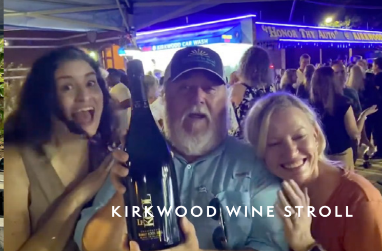
KIRKWOOD WINE STROLL