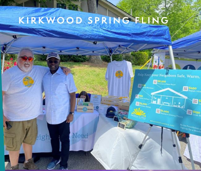
KIRKWOOD SPRING FLING