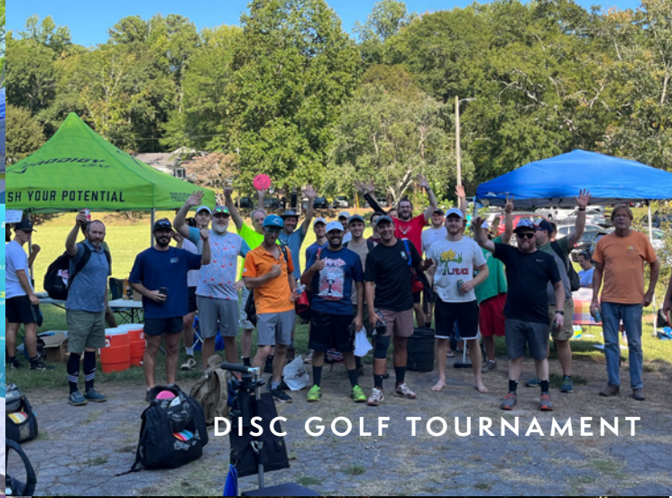
DISC GOLF TOURNAMENT