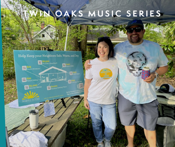
TWIN OAKS MUSIC SERIES